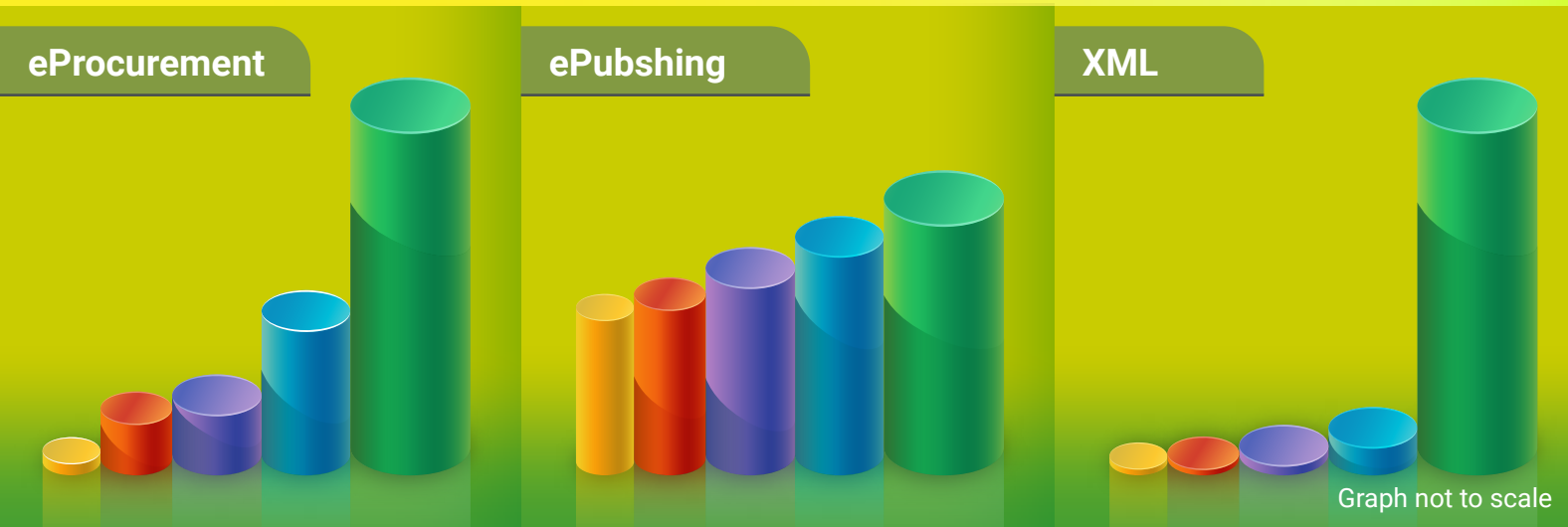
Graph not to scale