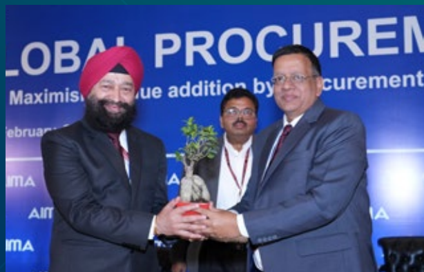
Advisor PPD felicitating DG NIC