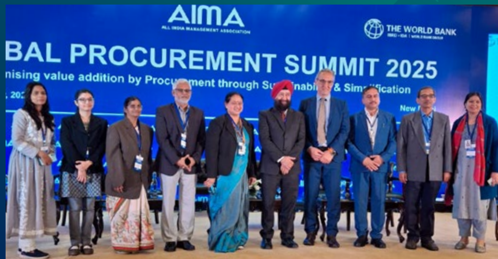
NIC and ADB Team with DG NIC