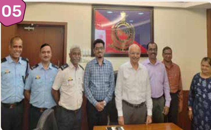
One day training on eProcurement for Directorate of Maharashtra Fire Services on 11 th June 2025 at Maharashtra.