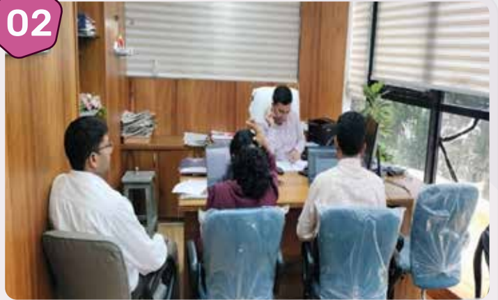
One day training on eProcurement for officials of Maharashtra Industrial Development Corporation on 10 th June 2025 at Maharashtra.