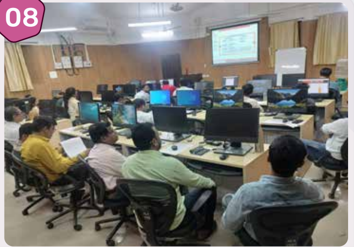
One day training on eProcurement on 25 th June 2025 for the officials of Home Department at JKIMPARD, Jammu. Training was attended by 17 Officers.