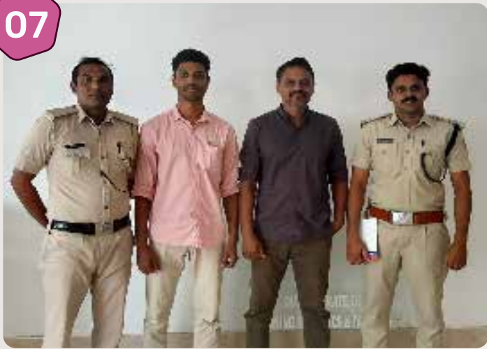
A three day training on eProcurement from 24 th June 2025 to 26 th June 2025 for officials from the Departments of Sports, Tourism, Police, and Environment & Forest at UT of Lakshadweep.