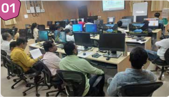
One day training on eProcurement for the officials of Civic Training Institute and Research Centre, Mumbai on 6 th June 2025 at Maharashtra. Twenty five officers attended the session.