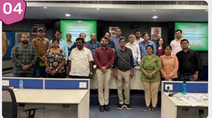
One day training on eProcurement for the officials of RITES Ltd on 11 th June 2025 at RITES, Gurugram. Around 60 official attended the training offline & online.