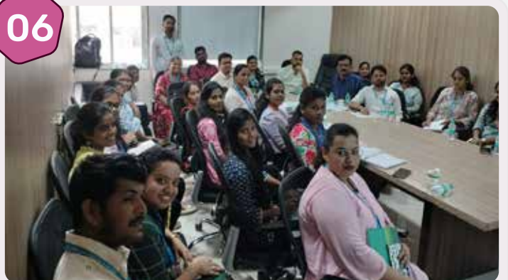
One day training on eProcurement for the officials of Directorate of Health Services (Maharashtra State) on 13 th June 2025. 30 officers attended the training.