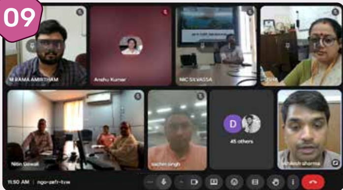
One day online training on Tender cum Auction on 25 th June 2025 for the officials of Mazagon Dock Shipbuilders Limited and National High Speed Rail Corporation Limited. Around 70 officials attended the training.