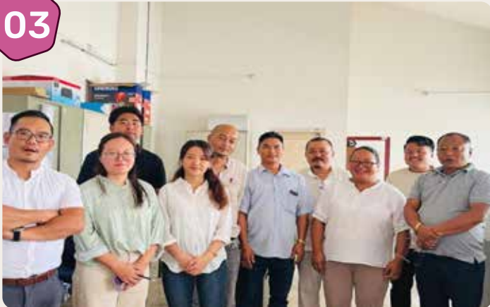
One day training on eProcurement for the officials of Department of Industries & Commerce, Government of Nagaland on 10 th June 2025.