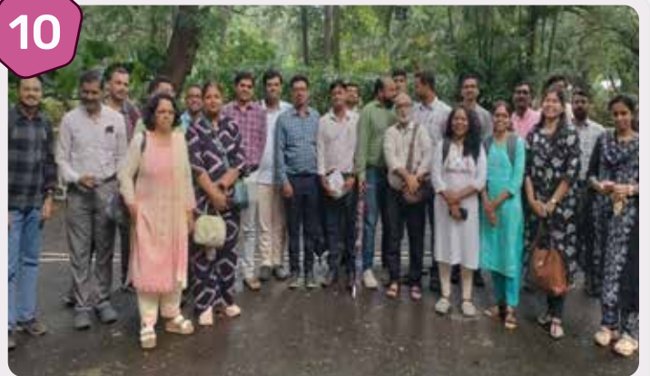
One day training on eProcurement for Brihanmumbai Municipal Corporation on 27 th June 2025 at Maharashtra. 28 officers attended the training.